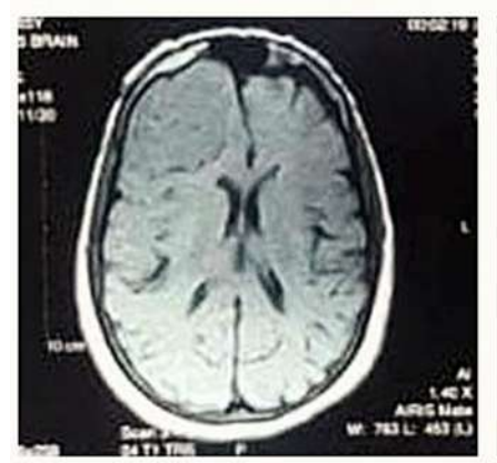
Figure 2: Magnetic Resonance Imaging (MRI) Brain (Axial View) showing a right frontal meningioma

No recent head injury or active epilepsy