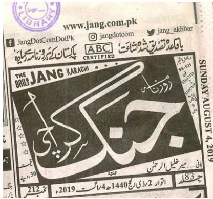
PAGE # 6