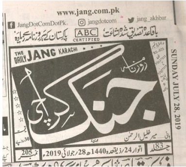
PAGE # 37