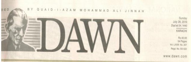
PAGE # 5