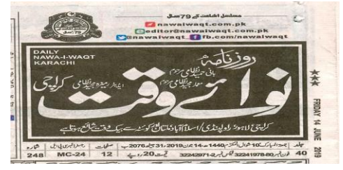
PAGE # 3