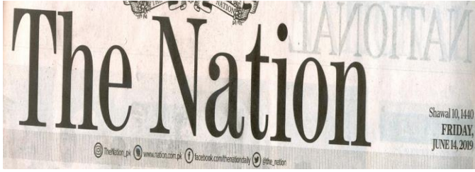
PAGE # 4