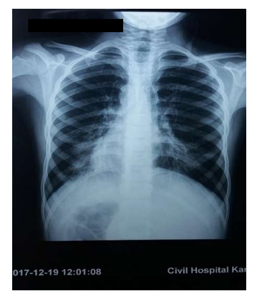
Fig.3 X Ray Chest P.A view showing cardiac shadow on the right side and bronchiectasis changes in the lungs