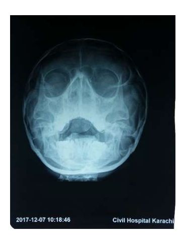
Fig.2 Plain X ray of the nose and PNS showing opacities in bilateral nasal cavity and sinuses