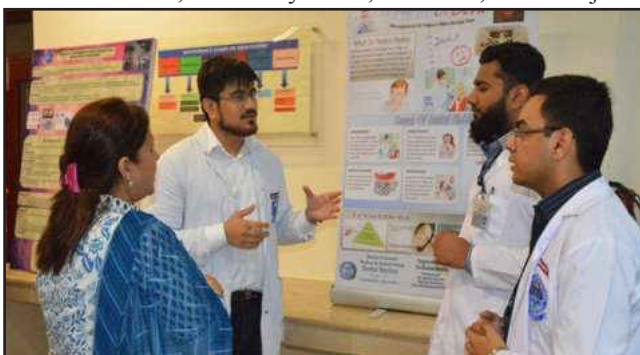
Students Presenting before a Judge for Poster Evaluation