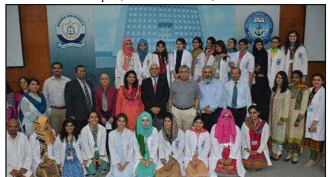
Group Photo with Director General, Judges and Departmental Faculty