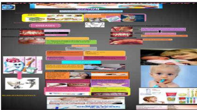
3 rd Position Poster Titled: Dental Care for Mother and Child