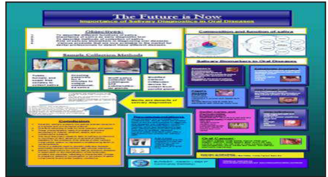
2 nd Position Poster Titled: Importance of Salivary Diagnostics in Oral Diseases