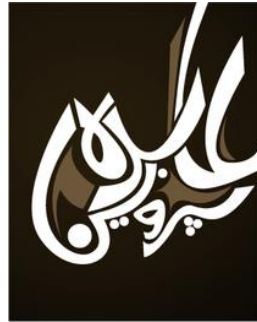
Figure 1. (a) Isolated Characters (b) Text in monograms (Irregular text)

Four parameters and their possible values defined in the framework to explore the text features are shown in table 1.