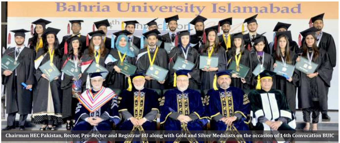
Chairman HEC Pakistan, Rector, Pro-Rector and Registrar BU along with Gold and Silver Medalists on the occasion of 14th Convocation BUIC