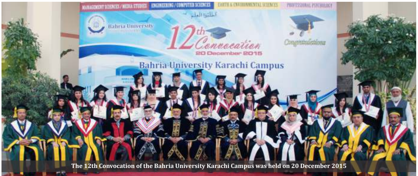
The 12th Convocation of the Bahria University Karachi Campus was held on 20 December 2015