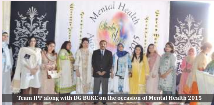
Team IPP along with DG BUKC on the occasion of Mental Health 2015