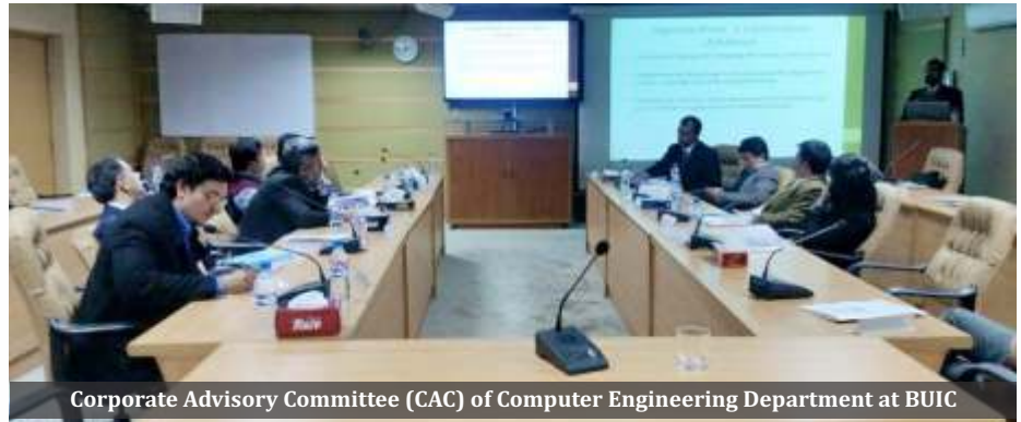
Corporate Advisory Committee (CAC) of Computer Engineering Department at BUIC

Corporate Advisory Committee (CAC) of Computer Engineering Department at BUIC assembled for its second meeting on 4 December 2015. Representatives of various well known technical organizations were invited to attend this meeting, which included Pakistan Software Export Board, ICT Asia, Ovex Technologies, Pakistan Software Export Board and Pakistan Institute of Entrepreneurship. All the faculty members of CE department, BUIC were also present on the occasion.