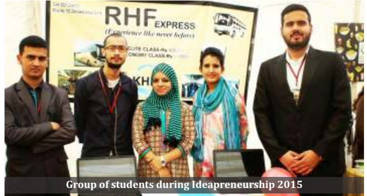
Group of students during Ideapreneurship 2015

entrepreneurial skills among the students. The event was attended by H o D Management Science, Faculty, Staff members and several students groups. The exhibition had forty inspiring stalls. After a thorough evaluation, at the end of