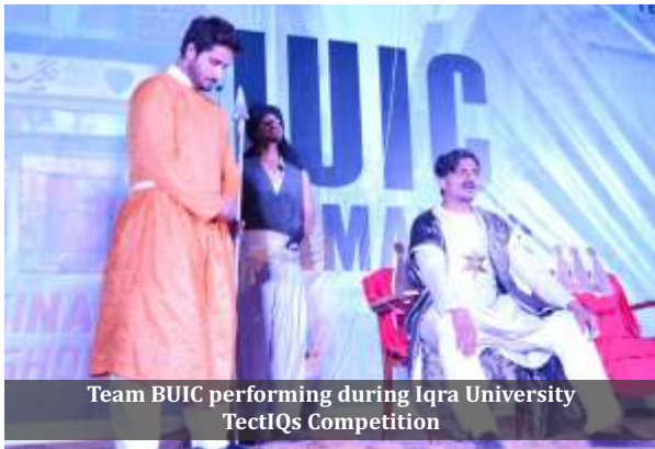
Team BUIC performing during Iqra University TectIQs Competition

A team from BUIC, participated in a well known event Iqra University TectIQs Competition, held during 26 to 29 November