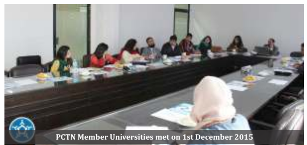
PCTN Member Universities met on 1st December 2015

BU is a member of the Pakistan Chapter for Talloires Network (PCTN) housed at NUST since July 2013. PCTN Secretariat has an intention to start some collaborative community service projects. To discuss the possibilities, a meeting of focal persons from PCTN member universities of Rawalpindi and Islamabad was held at NUST on 1 December 2015. From BUIC, this was attended by Manager SSC and Assistant Manager CSP.