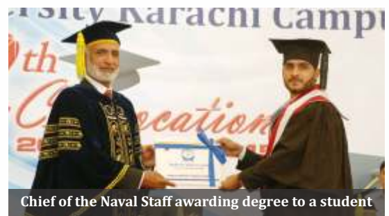
Chief of the Naval Staff awarding degree to a student

The event was attended by a large number of senior Naval Officers, Industrialists, Businessmen and parents of the graduating students.