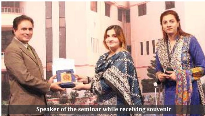
Speaker of the seminar while receiving souvenir

A good resume plays an important role in the job search for graduating students. It is a first impression to the potential employer. Keeping in view its importance, communication skills, confidence and good implications, a seminar was held on resume building subject, which will make them a good interviewing skills on choice for the employer.