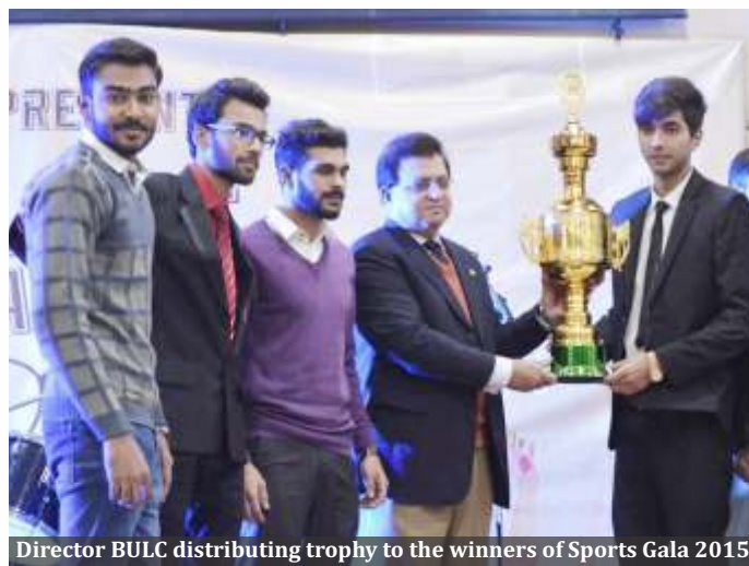
Director BULC distributing trophy to the winners of Sports Gala 2015

Sports Gala 2015 was held at BULC during 15 to 17 December 2015. Competitions of Cricket, Badminton, Basketball, Table Tennis and Chess were organized. It was attended by a considerable number of students from the campus.