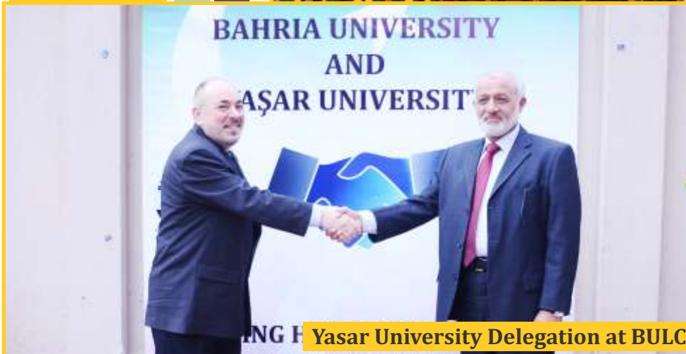
Yasar University Delegation at BULC