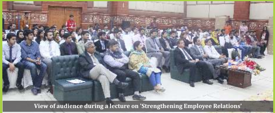
View of audience during a lecture on 'Strengthening Employee Relations'