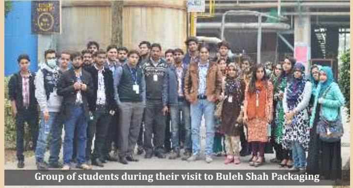
Group of students during their visit to Buleh Shah Packaging

Similarly, on 21 December 2015, another visit to Fine Packages was arranged. It was started with a lecture on supply chain management. Later on, students viewed the real