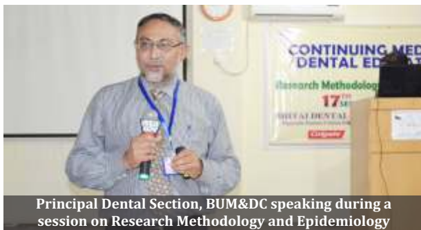
Principal Dental Section, BUM&DC speaking during a session on Research Methodology and Epidemiology

BUM&DC Dental section participated in a Continuing Medical Education (CME) / Continuing Dental Education (CDE) session on Research Methodology and Epidemiology, hosted by Bhitai Dental and Medical College on 17 November 2015. It was aimed at educating dental faculty, students and practitioners from other institutes as well, about the basics of Research including principles of research designing, procedures and applications of epidemiology for conducting a research. A number of experienced instructors were invited to share their knowledge with the participants on this platform.