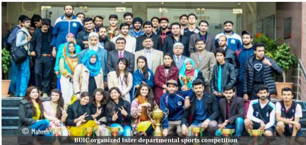
BUIC organized Inter departmental sports competition

Various games were played during this contest, which included Basketball, Table Tennis, Volleyball and Badminton. Amongst all, Department of Social Sciences won maximum competitions and declared as Sports Champion for the whole semester.