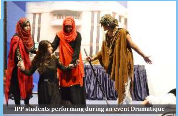
IPP students performing during an event Dramatique

Loneliness, enlightenment and change were the themes opted for the acts. The main purpose of this event was to inculcate and polish the oral communication as well as public speaking skills of the students.