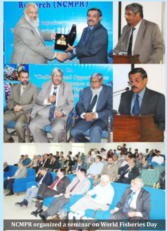
NCMPR organized a seminar on World Fisheries Day

opportunities for Pakistan to generate substantial economic growth. This enlightening session was attended by various prominent Dignitaries, Naval Officers, Government Officials, Marine Scientists, Intellectuals, Researchers, representative of Fishermen community from Sindh, Baluchistan and stakeholders of Fisheries Sectors.