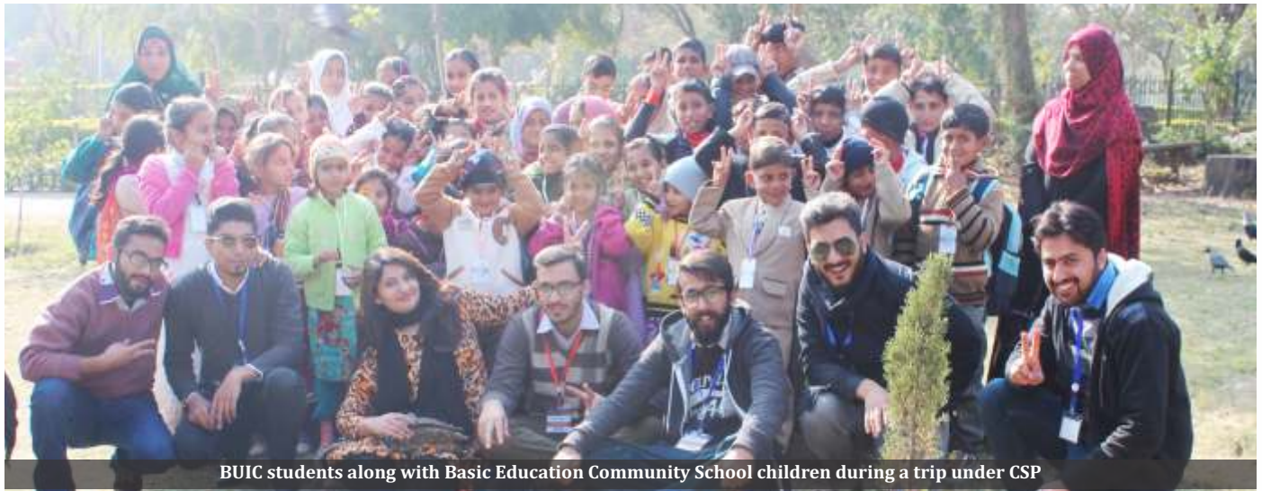
BUIC students along with Basic Education Community School children during a trip under CSP

Similarly, on 20 November 2015, BUIC signed a