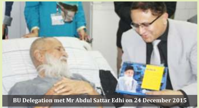
BU Delegation met Mr Abdul Sattar Edhi on 24 December 2015