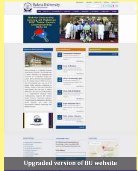
Upgraded version of BU website

BU has successfully launched top of the line testing method of