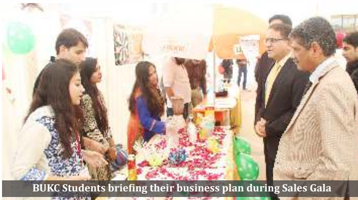
BUKC Students briefing their business plan during Sales Gala

BUKC Management Sciences Department organized an educational event Sales Gala on