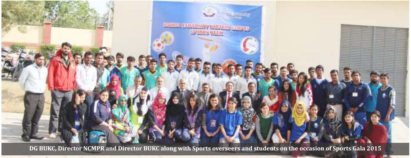
DG BUKC, Director NCMPR and Director BUKC along with Sports overseers and students on the occasion of Sports Gala 2015

Keeping its tradition alive, BUKC held Sports Week Fall 2015 from 24 to 30 December 2015 at the Campus premises. Different games including Football, Cricket, Table Tennis, Volley ball, Chess, Scrabble, and Badminton were played.