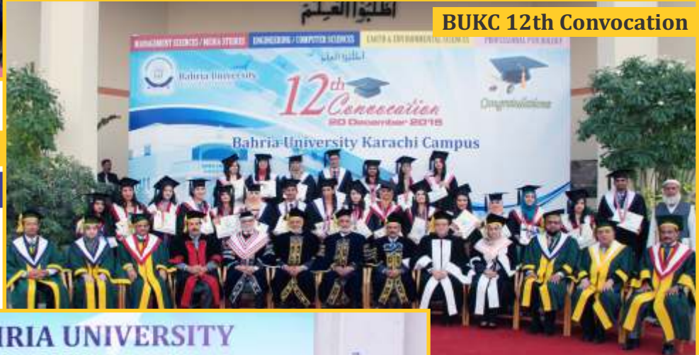
BUKC 12th Convocation