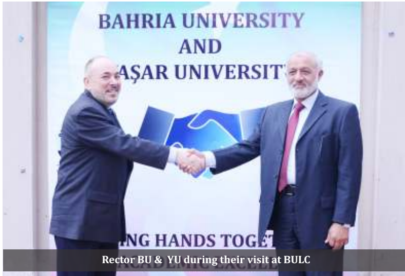
Rector BU & YU during their visit at BULC