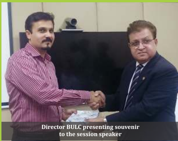
Director BULC presenting souvenir to the session speaker