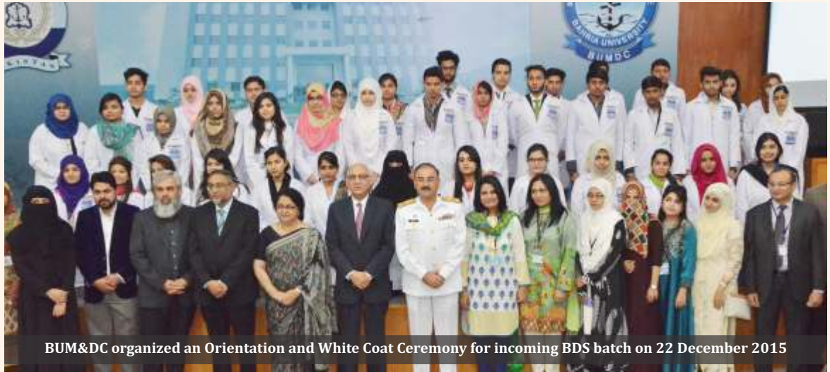
BUM&DC organized an Orientation and White Coat Ceremony for incoming BDS batch on 22 December 2015