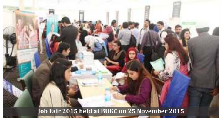
Job Fair 2015 held at BUKC on 25 November 2015

prevailed among the academic institutions to enhance their students' placement capacity. Moreover, it is a source of networking with the renowned organizations for the students and Alumni. BU also has