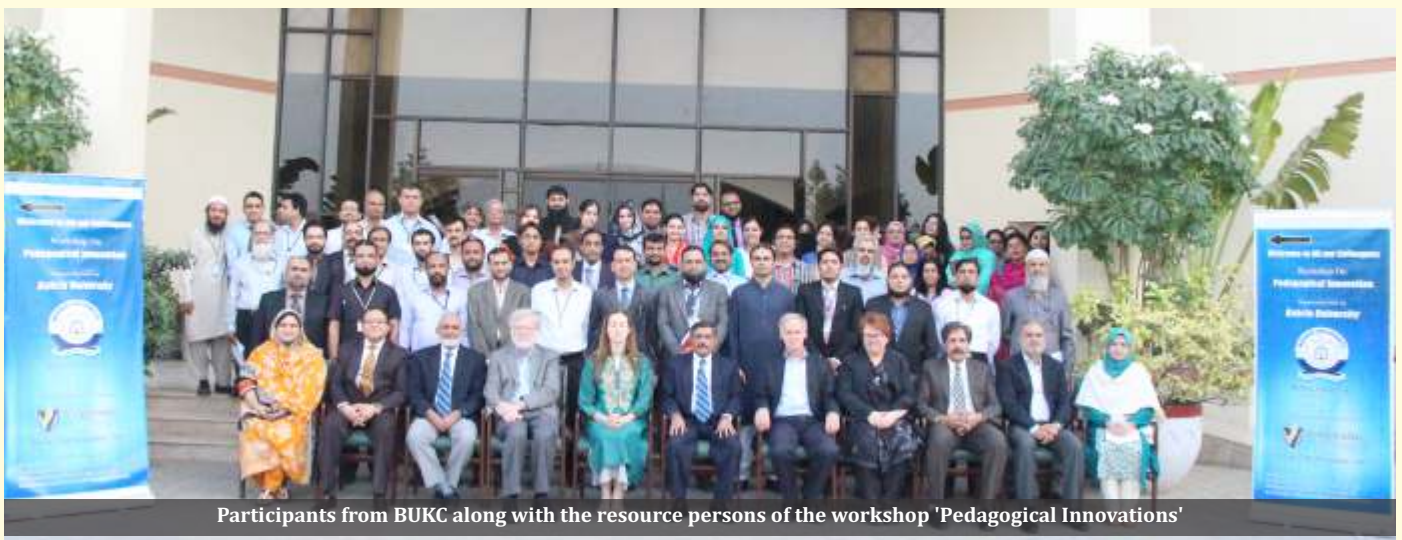
Participants from BUKC along with the resource persons of the workshop 'Pedagogical Innovations'