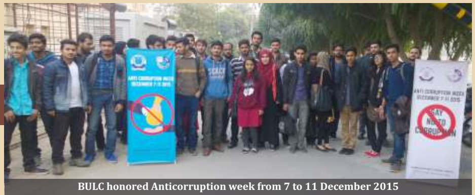
BULC honored Anticorruption week from 7 to 11 December 2015

BULC also observed the NAB Anticorruption week and held various activities during the entire week from 7 to 11 December 2015. The activities