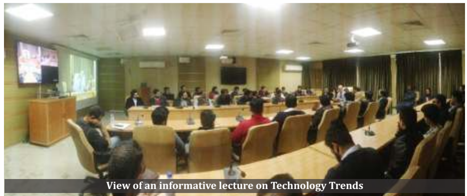
View of an informative lecture on Technology Trends