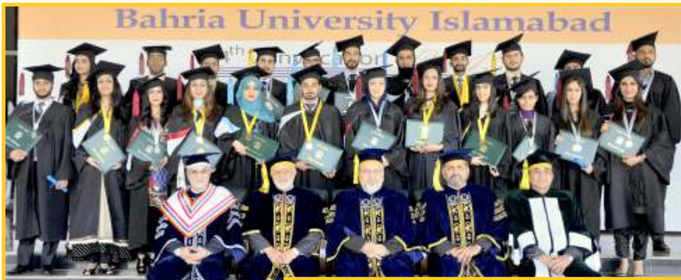
BUIIC 14th Convocation