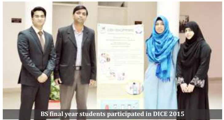
BS final year students participated in DICE 2015

designed to facilitate customers in order to provide them with a pleasure experience while grocery shopping. Customers can use their smart phones along with indoor technologies including Wi-Fi and Bluetooth for locating items