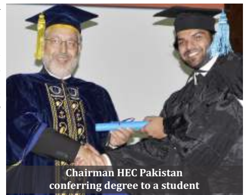
Chairman HEC Pakistan conferring degree to a student

A large number of students, parents, faculty members and other dignitaries attended this memorable event.