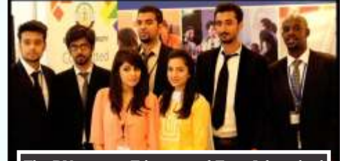
The BU team at Educational Expo Islamabad