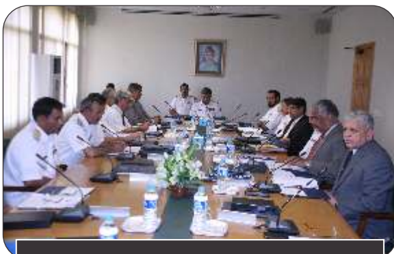
The 27th BOG in progress chaired by CNS

The 27th meeting of the Board of Governors of Bahria University was held on 21st June 2013 at the Bahria University Headquarters Islamabad. The meeting was chaired by Admiral Mohammad Asif Sandila NI (M), Chief of Naval Staff/ Pro-Chancellor & Chairman Board of Governors Bahria University and attended by the board members, with a heavy agenda. A detailed briefing was given on the progress of various on-going projects, with special reference to expansion of academic areas, new infra structures, financial audits and additional educational facilities in various campuses. Annual Budget of the University for the Year 2013-2014 was also approved in the meeting.