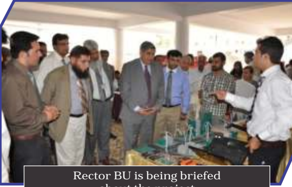
Rector BU is being briefed about the project