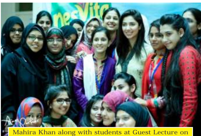
Mahira Khan along with students at Guest Lecture on Healthy Lifestyle by Nestle Nesvita on 12th April 2013 at Bahria University Karachi Campus.