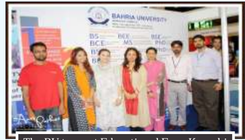
The BU team at Educational Expo Karachi