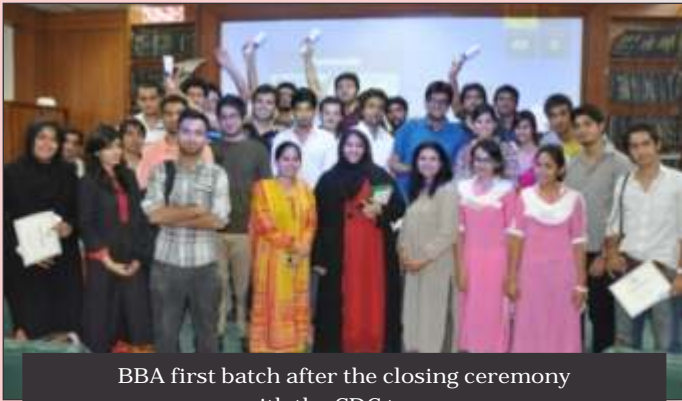
BBA first batch after the closing ceremony with the CDC team.

Community Service/civic engagement program is an essential degree completion requirement for undergraduates at Bahria University campuses. Under this program, Bahria University students devote 40 hours during their university tenure towards Community Support Programs. In doing so, the students of BU have assisted reputable organizations in society through diverse activities for social causes.