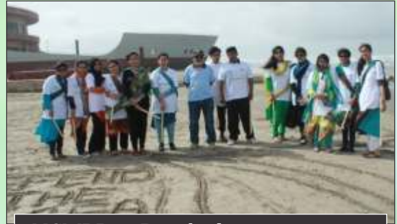
NCMPR at Beach cleaning activity