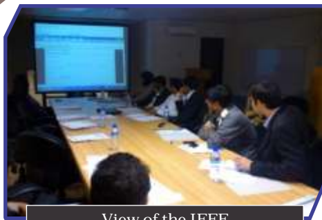
View of the IEEE Student Section Congress