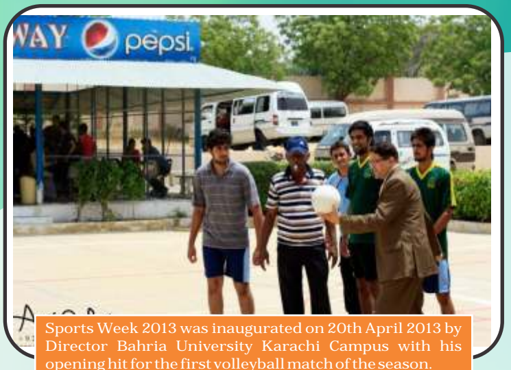
Sports Week 2013 was inaugurated on 20th April 2013 by Director Bahria University Karachi Campus with his opening hit for the first volleyball match of the season.