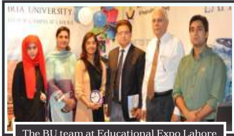
The BU team at Educational Expo Lahore

It also helped in introducing and promoting the new Lahore Campus of BU in three big cities of Pakistan. At the closing ceremony of the event, shield of appreciation was awarded to the PR Officer by the