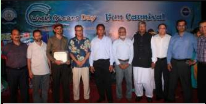
DG NCMPR, DG Pakistan Maritime Museum, Director BUKC, Director NCMPR, along with organizing team of Fun carnival on World Oceans Day