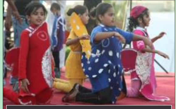
Performances by special children school

National Centre for Maritime Policy Research (NCMPR) observed the World Oceans Day for the first time in Pakistan by organizing a Walk on Beach and Cleaning Activity on 7 June 2013 at Sea View and a Fun Carnival on 8 June 2013 at Maritime Museum. The activities of the Day conducted by NCMPR highlighted the importance of the oceans and