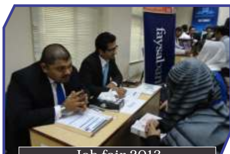
Job fair 2013 for Graduating Students

The Student Resource Centre and Administration Department representatives of Bahria University Karachi Campus organized the British Council Counselling Symposium on 19-20 June, 2013 at Bahria University Karachi Campus. The event highlighted the importance of career counselling. Leading educationists attended the premier event. Director Karachi Campus inaugurated the Counselling symposium. He mentioned that Bahria University has institutionalized career counselling where our students are given individual career counselling services comprising of CV writing, Mock Interviews, Corporate Grooming, Job Advice as well as group career guidance sessions.