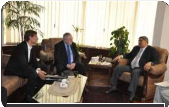
Rector BU along with delegation from Germany