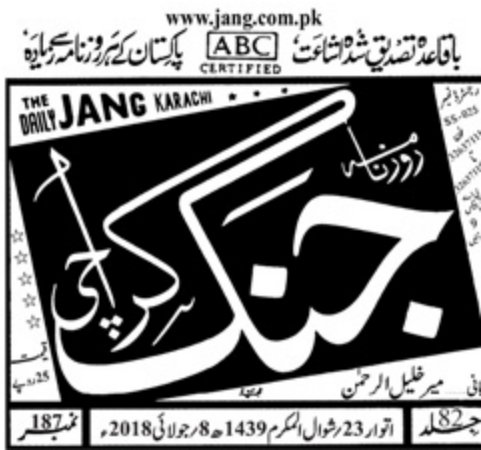
PAGE # 21