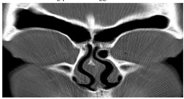
Figure: 3 CT scan paranasal sinuses coronal image showing haller cells on both sides