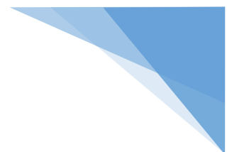
TABLE OF FIGURES