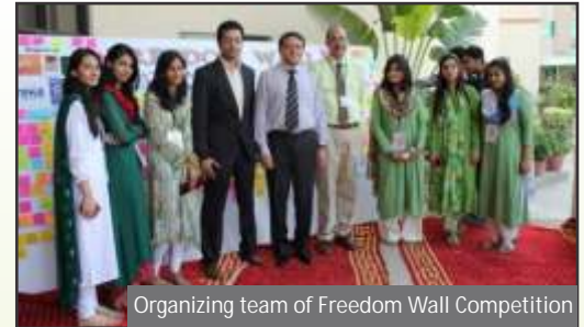
Organizing team of Freedom Wall Competition

Freedom Wall a new concept was initiated by Assistant Director- Student Resource Center. A plain panaflex wall was placed outside the main foyer building in which students, faculty and staff members expressed their positive ideas on the wall by suggesting ways to make Pakistan a better place to live. The event was executed by seven passionate MBA student's club 'Studio We' of Bahria University, Karachi Campus.