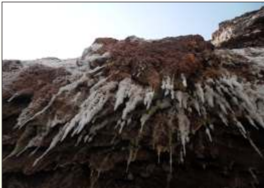
Khewra Salt Range

The department of Earth and Environmental sciences has arranged a field trip to salt Range, Tarbela and oil Industry in Islamabad. The group of 46 students of Geophysics lead by two faculty