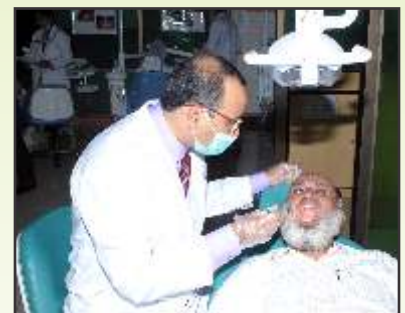
Oral examination at BUMDC

These objectives were achieved by the Bahria University Dental College faculty and they are heartily congratulated on their success.