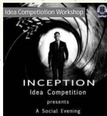
Idea Competition Workshop

In this semester BU ISB have organized two workshops about cloud computing and presentation skills to equip our students with self development skills. The main event for this semester was Inception Idea Competition. For which we have conducted extensive marketing to attract students to participate in it. Students of organizing body worked whole heartedly for this event. They have shown the English feature film "Sky fall", placed registration desk in front of New cafe and distribution of event pamphlets.