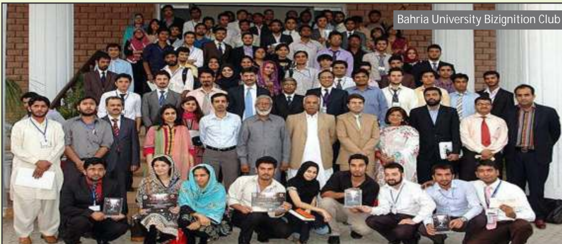
Bahria University Bizignition Club

students to represent their selves in front of industrialists and professionals who help students to flourish their selves in the market as per requirement.