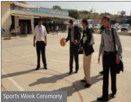
Sports Week Ceremony

Sports help not only in building personalities of students but also encourage team work. Sports are integral part of Bahria University, Karachi Campus. Sports Week opened in Karachi Campus on Monday, 26 Nov, 2012. 1500 students from all departments of the campus participated in the event in different sporting events like Basketball, Cricket, Volleyball, Soccer, Futsal and Badminton. The event was inaugurated by Director, Karachi Campus.