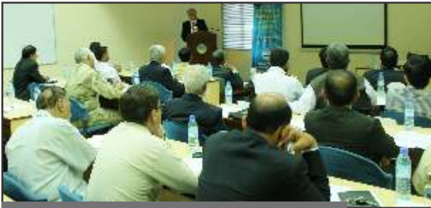
Sustainable Management of Marine Fisheries Workshop

Managing fisheries for sustainable development is a multi-dimensional and multi-level activity. In this regard National Centre for Maritime Policy Research (NCMPR) is joining fishing community around the globe in yearly observance of World Fisheries Day for long term management and sustainability of Marine Fisheries. A