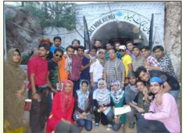
BU Geophysicists visit to Khewra Salt Range

geophysicists of Bahria University Karachi Campus.