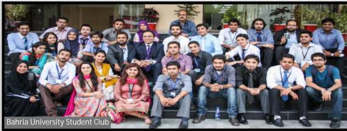
Bahria University Student Club

Bahria Business Club is the student body governs by Bahria University. It was established in 2010. Firstly it was only for Management Sciences but now it works for the benefits of all departments. It provides huge platform for the