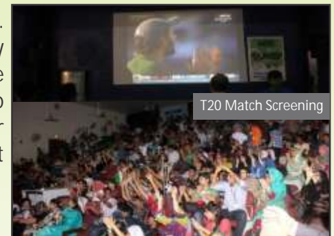
T20 Match Screening

during the screening of Pakistan vs. Australia match on Oct 2nd' 2012, every cricket lover at Bahria showed up. The university auditorium was brightened up with the cheers of the students for their team. The pictures from the event say it all.