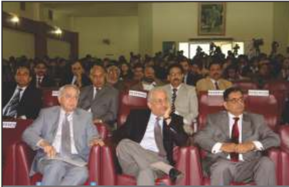
(NAB) Seminar on International Anti-corruption day

A Seminar on the "Role of Media in Combating Corruption" was organized by National Accountability Bureau (NAB) at Bahria University Islamabad, was held on the 5th December 2012.