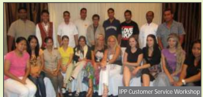
IPP Customer Service Workshop