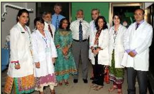
World Oral Health Day at BUMDC

The "World Oral Health Day" was celebrated on 12th September 2012 at Bahria University, Karachi campus. To mark this occasion, a free dental camp