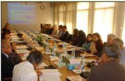
11th HERC Meeting