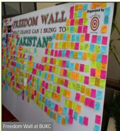
Freedom Wall at BUKC

"Freedom Wall Competition" winners were awarded with prizes on Monday, 26 Nov, 2012. The winners included three students, one faculty member and one staff member. Director and Assistant Director-Student Affairs were presented with souvenirs for their cooperation during the event. Winner Students wrote the following statement on the wall.