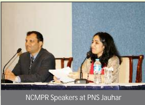
NCMPR Speakers at PNS Jauhar