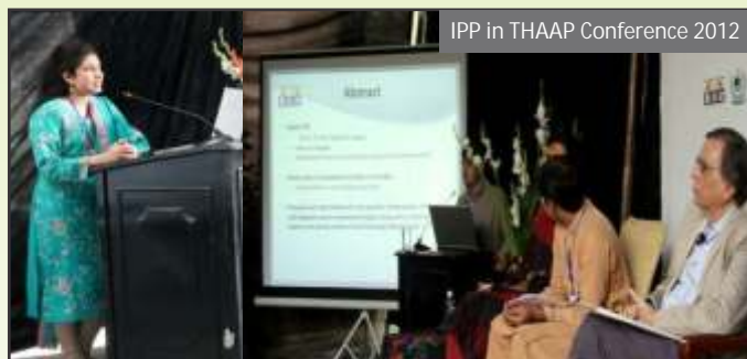
IPP in THAAP Conference 2012