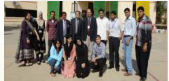
Sports Week Ceremony

Sports help not only in building personalities of students but also encourage team work. Sports are integral part of Bahria University, Karachi Campus. Sports Week opened in Karachi Campus on Monday, 26 Nov, 2012. 1500 students from all departments of the campus participated in the event in different sporting events like Basketball, Cricket, Volleyball, Soccer, Futsal and Badminton. The event was inaugurated by Director, Karachi Campus.