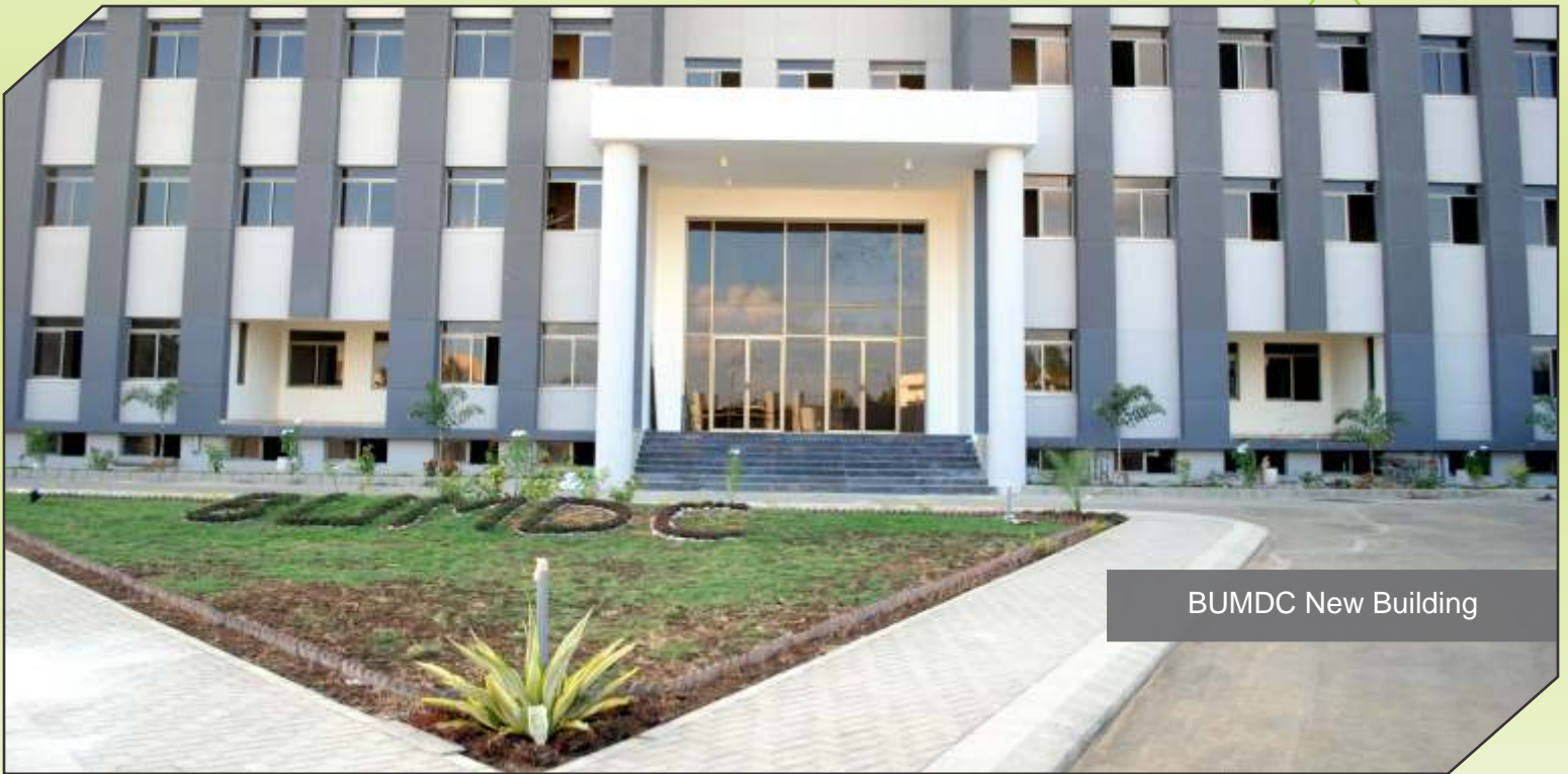
BUMDC New Building