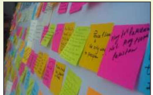
Freedom Wall Competition at BUKC