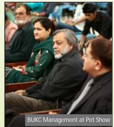
BUKC Management at Pet Show

Relationships between men and pets have existed for ages. According to a French study, more than sixty percent of people interviewed, believed that presence of a pet at home favored communication between family members. Bahria University decided to celebrate this beautiful relationship between their students and their pets. Student Resource Centre, along with students of Bahria University Karachi Campus organized "Your Superstar Pet" on Dec 16th' 2012. 72 pets were registered for the event and hundreds of audience attended the event. The event was judged by professionals from veterinary field and was graced by DG and Director Bahria University Karachi Campus.