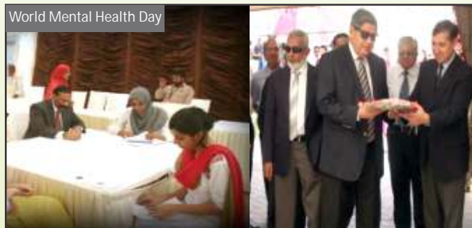
World Mental Health Day