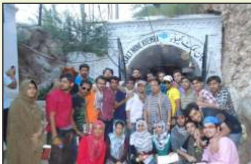
BU Geophysicists visit to Khewra Salt Range