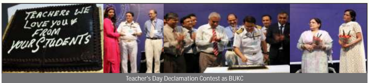
Teacher's Day Declamation Contest as BUKC

For all the efforts that teachers put in to make the lives of their students, world celebrates teacher's day to pay regard to these mentors, these guiders and these great people who contribute to every student's life, on October 05 every year. To show their love for the teachers at Bahria University, Karachi Campus, students, along with SRC, arranged for a declamation contest followed by a "Cake cutting ceremony" by the Director, Karachi Campus. Students were awarded trophies for the best English and Urdu speakers, whereas the teachers enjoyed not only the program but also the celebration in their honor.