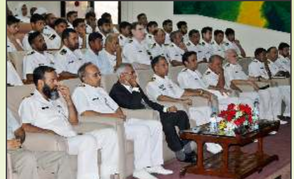
World Maritime Day at PNS Jauhar

International Maritime Organization (IMO) celebrates the World Maritime Day (WMD) every year. Theme for the year 2012 is "100 Years after Titanic; Safety of Life at Sea". To highlight the importance of the day, Pakistan Navy decided to organize the World Maritime Day in Pakistan Navy Engineering College in Collaboration with National Centre for Maritime Policy Research (NCMPR) on 19th October 2012 at PNS JAUHAR auditorium.