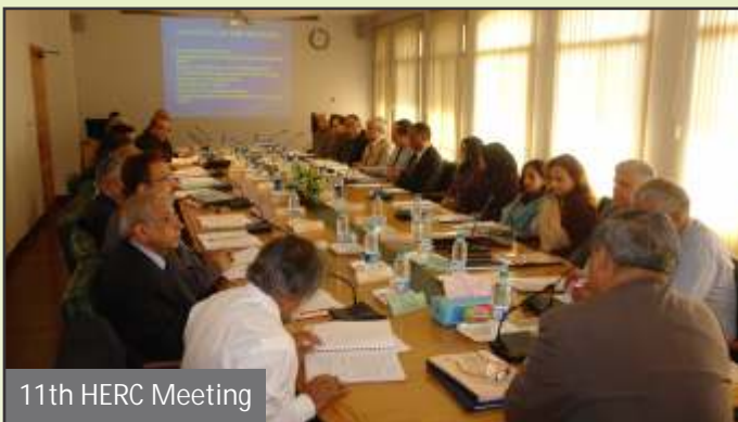
11th HERC Meeting