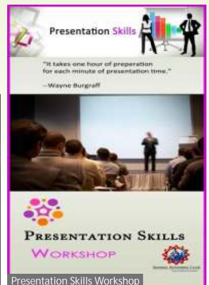
Presentation Skills Workshop