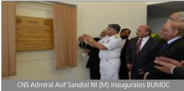
CNS Admiral Asif Sandila NI (M) inaugurates BUMDC

The Inauguration Ceremony of new premises of Bahria University Medical and Dental College (BUMDC) was held on 29 th January 2013 at Karachi. Chief of the Naval Staff and Pro-Chancellor of Bahria University, Admiral Mohammad Asif Sandila NI(M) graced the occasion with his presence as the Chief Guest.