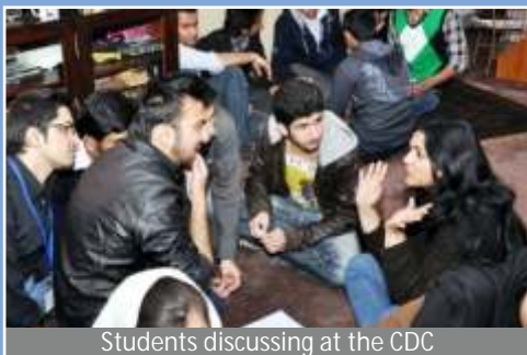
Students discussing at the CDC

Bahria University had initiated a "Community Support Program" in order to instill a spirit of service in its students in 2006, being the first Pakistani University to link its community programs with its degree. Taking another step in that direction, number of hours of community support have been increased to 40 and have been made mandatory on all students starting their studies from the Spring 2013. All students will have to complete 40 hours of community work as a degree requirement.