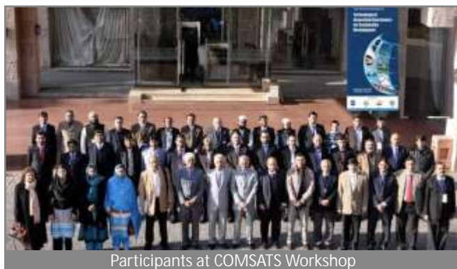
Participants at COMSATS Workshop