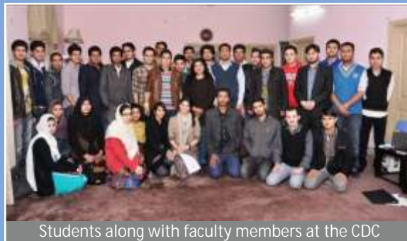
Students along with faculty members at the CDC